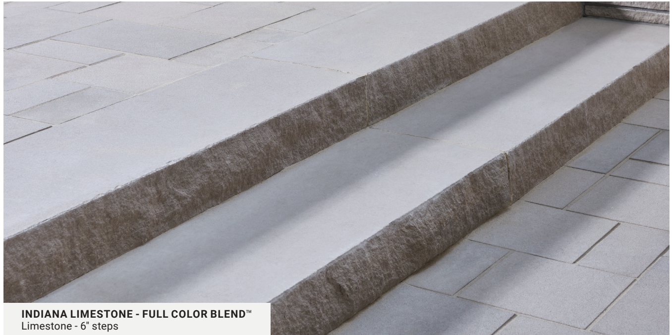
INDIANA LIMESTONE - FULL COLOR BLEND™ Limestone - 6" steps

6" steps add a distinct sense of permanence to hardscaped areas. Create durable and timeless step elements from single pieces of natural stone.