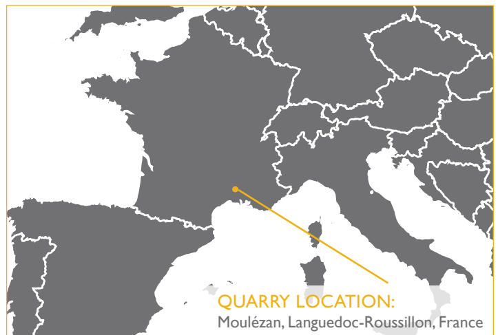
QUARRY LOCATION: Moulézan, Languedoc-Roussillon, France