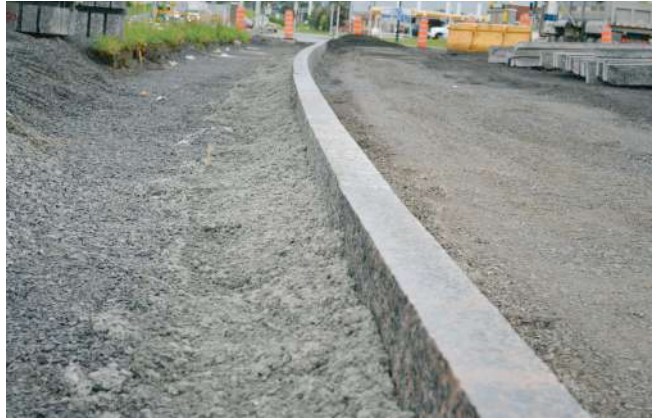
Light concrete (15 MPa) is poured in place to consolidate the curbstones.