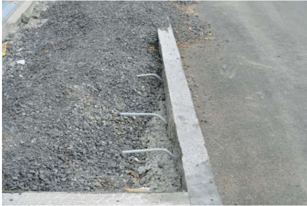
Curbstones with sidewalk anchor system.

Protect the curbstones and let the concrete set at least 48 hours before beginning any contiguous paving or concrete work.