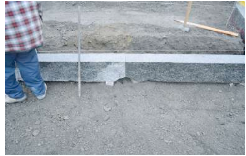
Figure 3. The sawn extremities allow for a precise joint between curbs and eliminate the need for mortar.