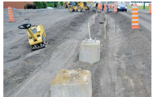
Figure 1. The crushed stone cushion is mechanically compacted to a density of 95%.