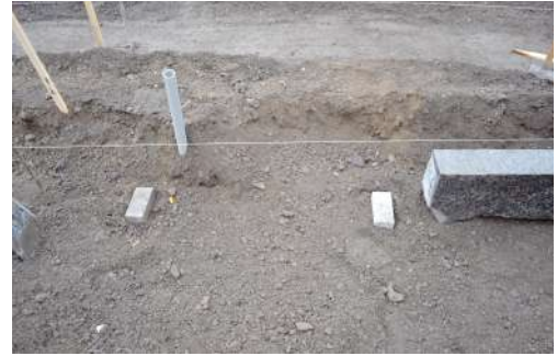
Figure 2. Concrete bricks are used to position the granite curb.