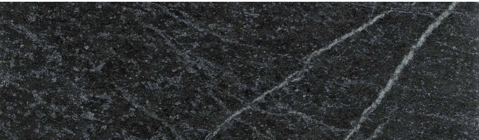
Alberene Soapstone Waterjet