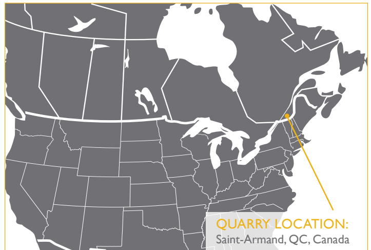
QUARRY LOCATION: Saint-Armand, QC, Canada