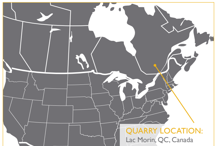
QUARRY LOCATION: Lac Morin, QC, Canada